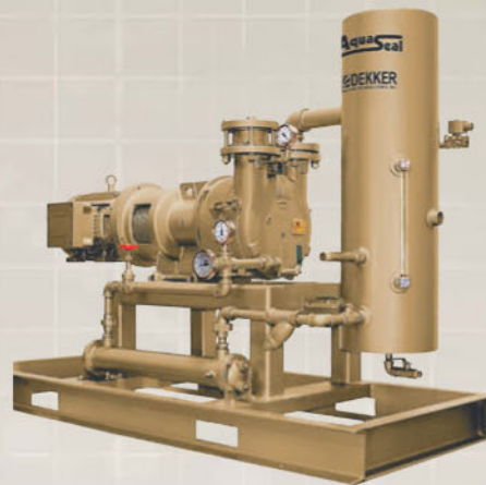
◀ 150 CFM Full-Recovery System

as well as custom-engineered units, to provide you with an economical and reliable solution for a wide variety of today's applications.