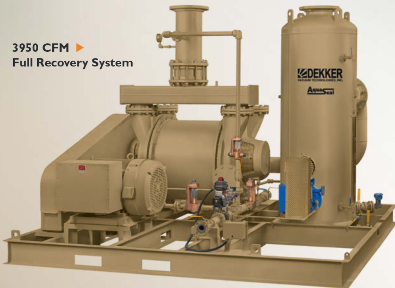
▶ 3950 CFM Full Recovery System