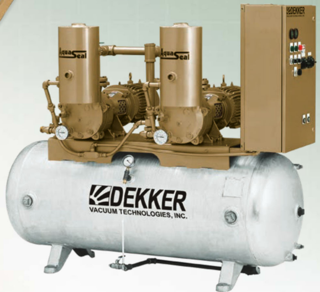
▶ 80 CFM Partial Recovery Duplex System