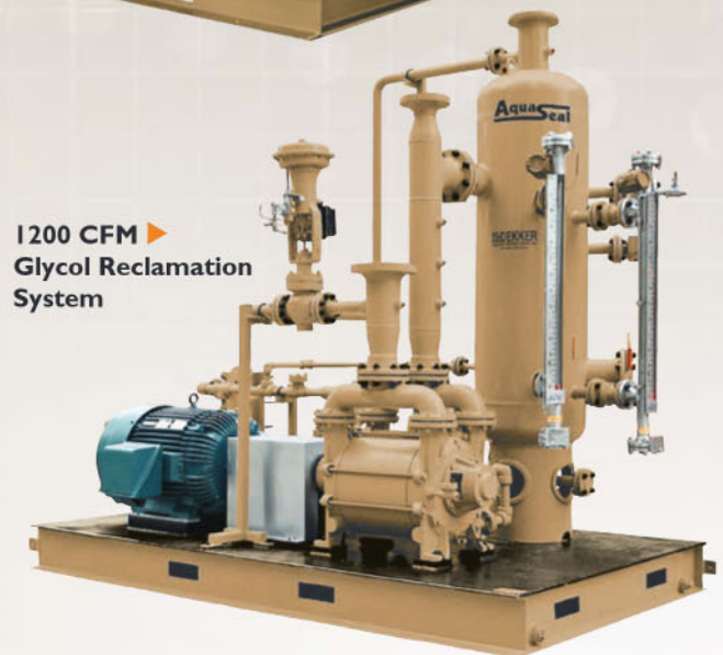
1200 CFM ▶ Glycol Reclamation System

Ask about our Maxima-C conical design two-stage pumps, available from 700-3,000 CFM.