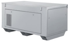
Sound Enclosure SH 13