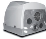
Sound Enclosure SH 18