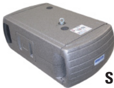
Sound Enclosure SH 19