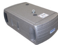
Sound Enclosure SH 20