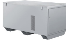
Sound Enclosure SH 12